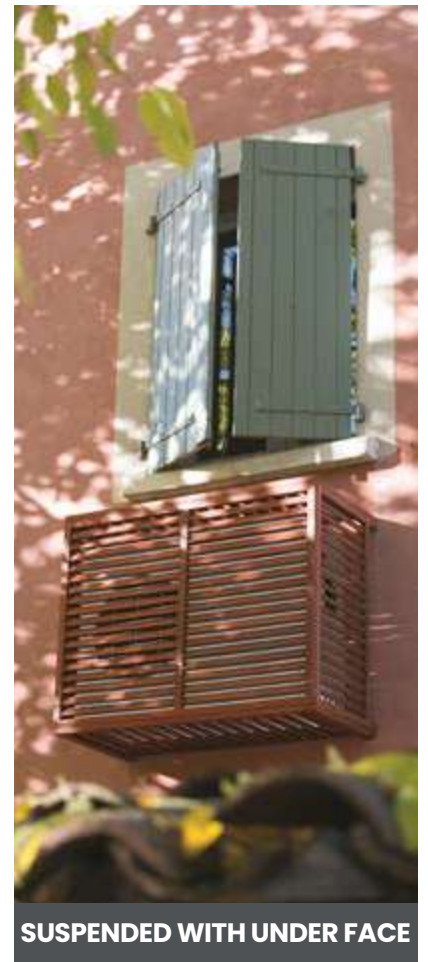
SUSPENDED WITH UNDER FACE