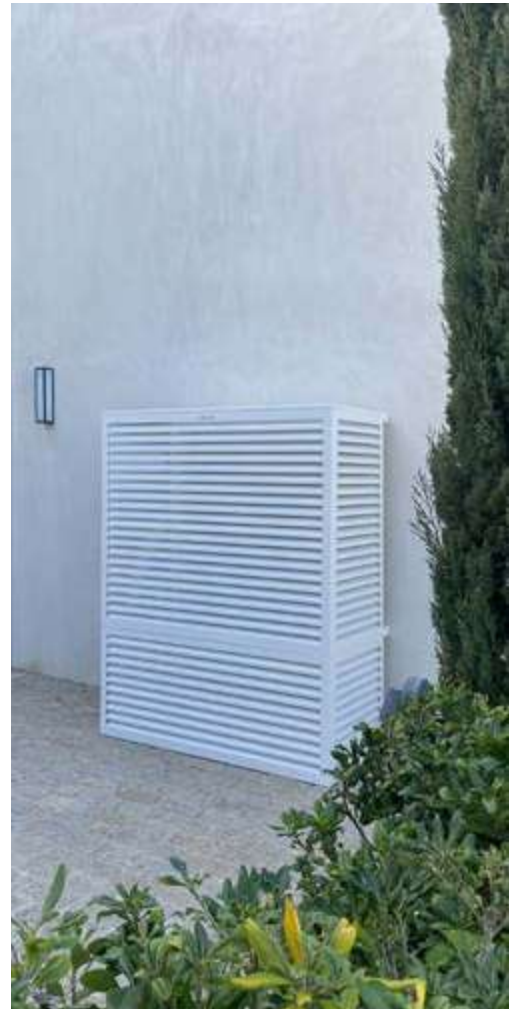
DECOCLIM® XL + XXL OPTION